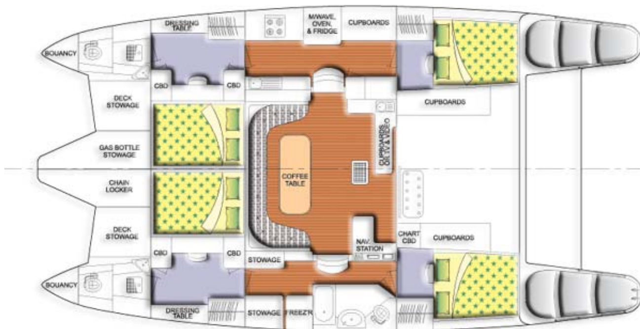
Dean 440 Below Deck Plan